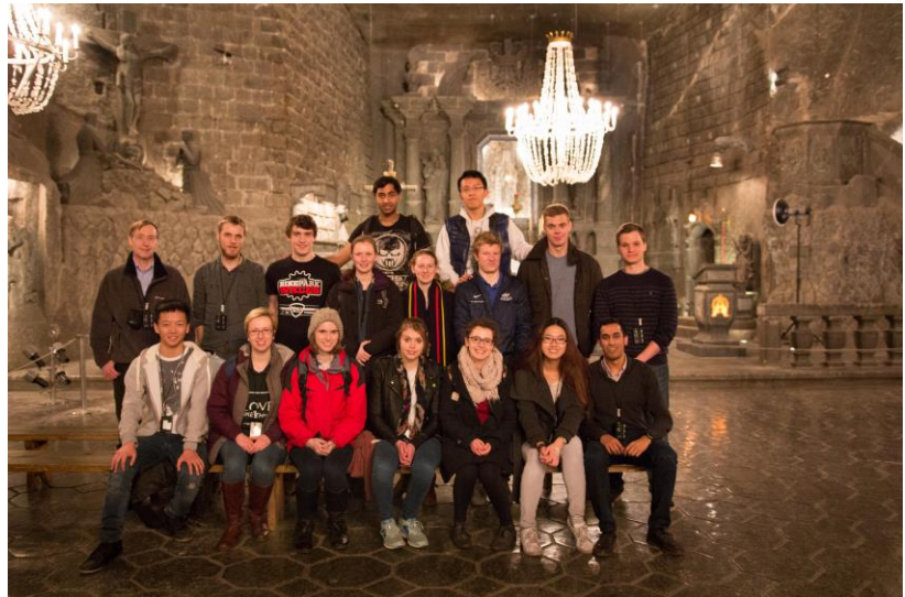
Group picture in the chapel of St. Kinga.

That afternoon we visited the Wieliczka Salt mines. Mining began in the 13 th century and the mine has continued to produce rock salt until very recently. The particularity of the mine is that some of its miners, after their long shifts, started to sculpt vast chambers and works of art on an unprecedented scale. This makes for a mine full of chapels, murals and various bas-reliefs depicting legend and faith. The highlight of the visit was the rather stunning Chapel of St. Kinga. This "underground salt cathedral", dedicated to the patron saint of the miners, is beautifully carved from salt and is filled with sculptures of different scenes of the bible and religious figures. The chapel, a UNESCO world heritage site, also houses relics of the late John Paul II. The variety of the features and the sheer scale of the mine were very impressive. It is truly inspiring to hear that men that worked long and tiring shifts in the mine stayed behind to carve and sculpt, dedicating years to their art.