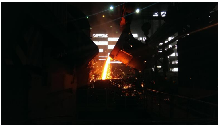
Heavy casting at Krakodlew S.A.

The next day's visit was in sharp contrast. We travelled to Oświęcim to visit the former Nazi concentration and extermination camp of Auschwitz-Birkenau. The events that unfolded on the site 70 years ago have shaped future geo-political and historical landscapes. It was an interesting but silencing visit that led to much reflection and contemplation.