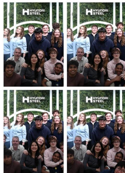
HYUNDAI STEEL WELCOME!

We visited the Hyundai integrated steel mill in Dangjin. Dangjin steel plant is a sprawling integrated steel plant that has a blast furnace, basic oxygen furnace, direct reduced iron and electric arc furnace technology, allowing them to refine iron ore and process it into steel all within the plant. We started with an introduction of the steel making process used in Dangjin, which uniquely features sheltered ore storage and transport infrastructure to maximise yield. We were then taken on a bus tour, where we saw each step of the steelmaking process, from ore storage to hot rolling and forging.